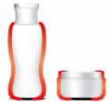
Underlap Labeling Type