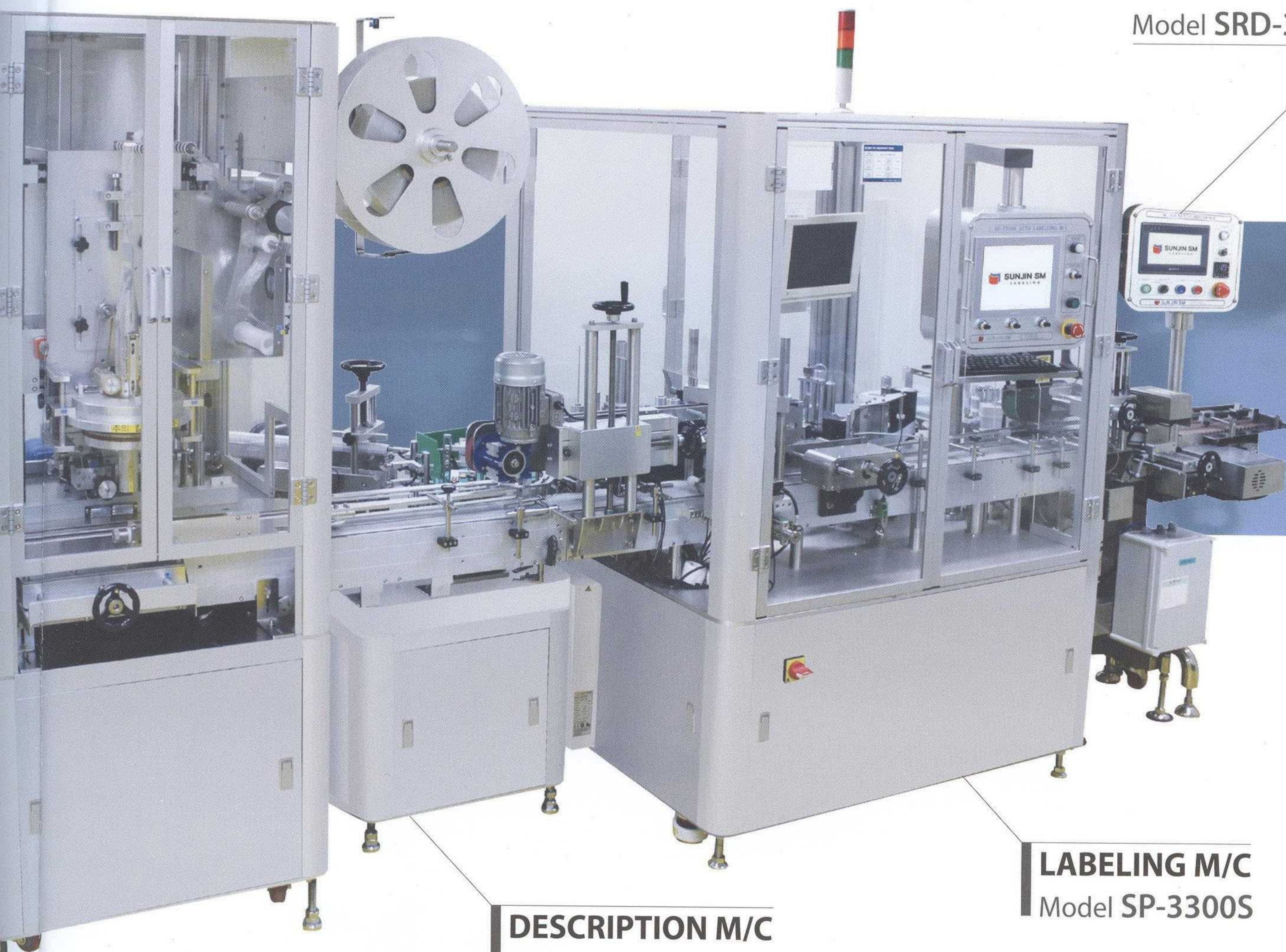
DESCRIPTION M/C Model SDT-5000