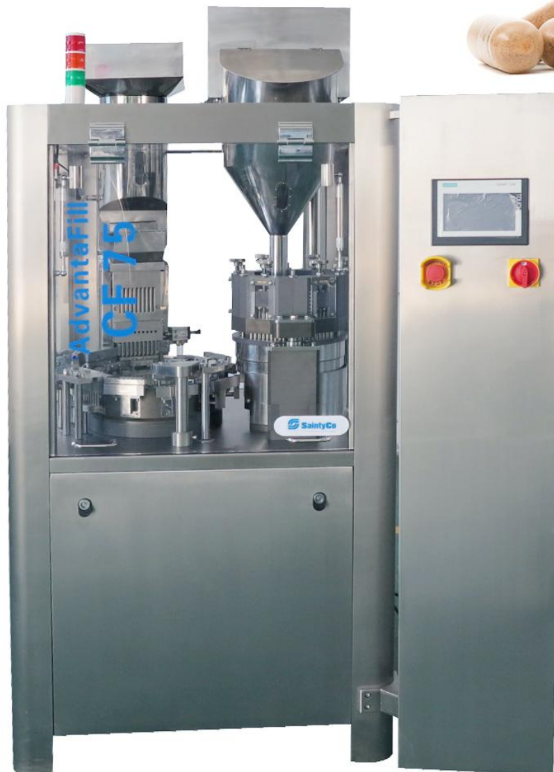
AdvantaFill CF 75