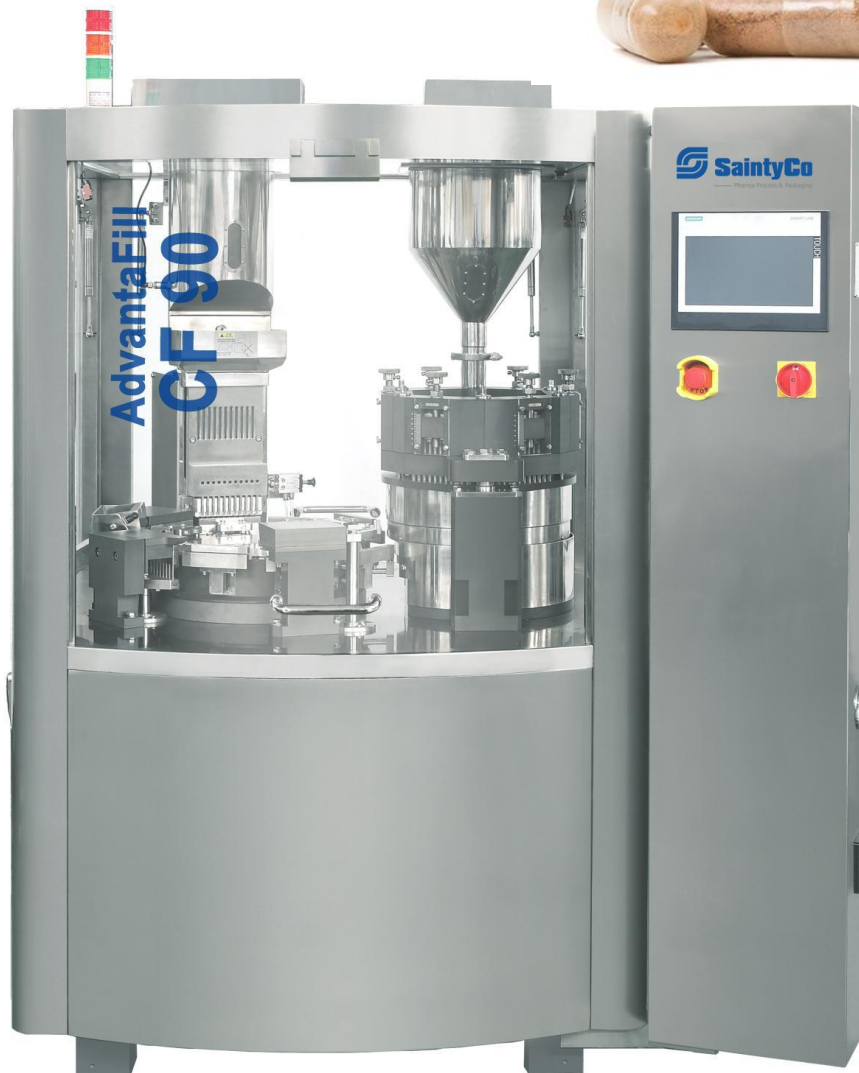
AdvantaFill CF 90