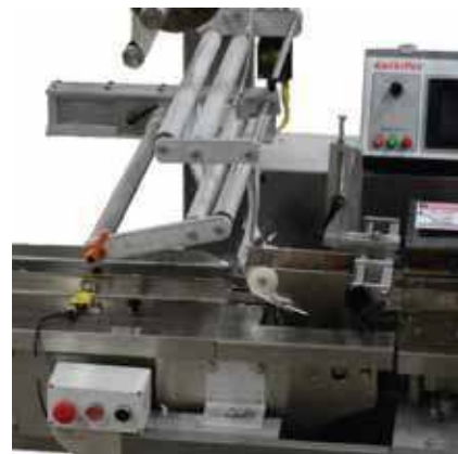
Adjustable Former | Easy size changeover for different products

The H90's unique EZ-SET end crimper phasing control allows the operator to position the crimper between products during initial setup, then easily fine tune the setting—all while the machine is running. It is powered by a robust 1/2 HP AC drive motor.