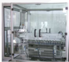
機台安全外罩 Machine safety cover