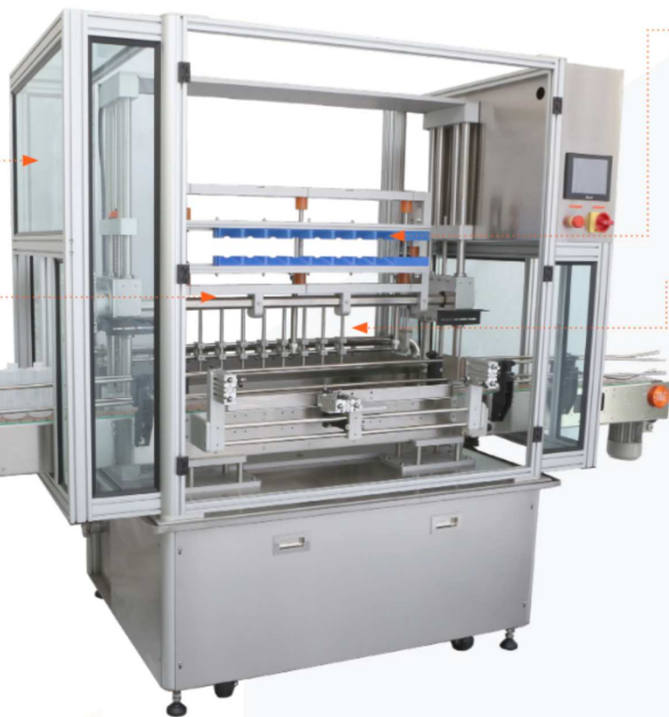
客製化夾瓶模具 Custom-made bottle clamp