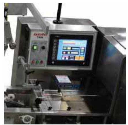
Quick Changeover | Simple machine control layout and adjustable former.

The Series 150 is easily customized to meet specific packaging needs and is available in right or left hand configurations.