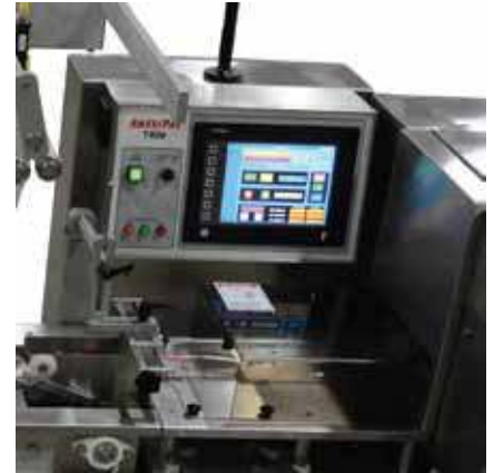
Quick Changeover | Simple machine control layout and adjustable former.

The Series 150 is easily customized to meet specific packaging needs and is available in right or left hand configurations.