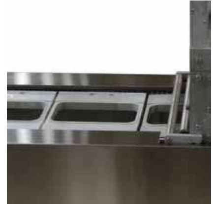
Quick-change tray holders | For processing various container sizes

Casters and a 110-volt electrical supply make the TD30M portable and flexible in operating the machine in a convenient location. The stainless steel and aluminum construction is ideal for strict sanitary applications.