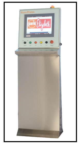
IPPC Panel for AFR Model