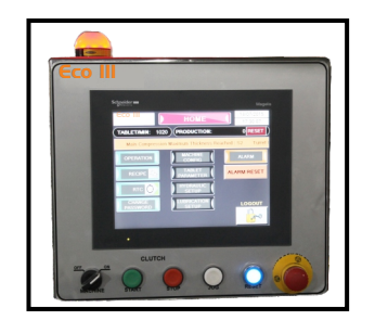
HMI Panel for Standard Model