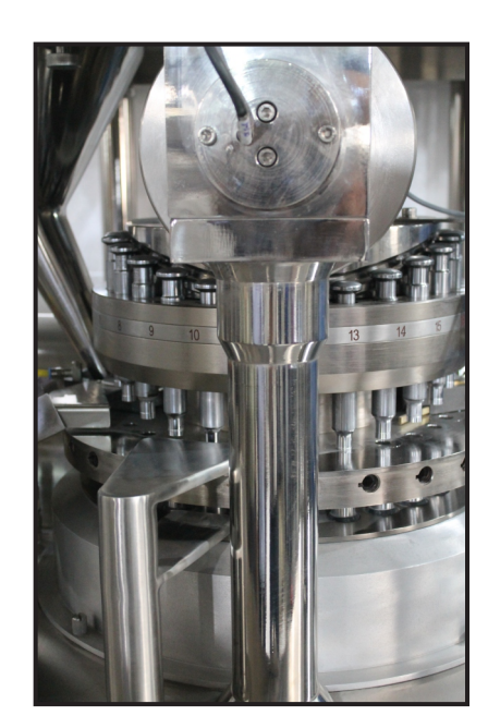
Main Compression with upper punch penetration