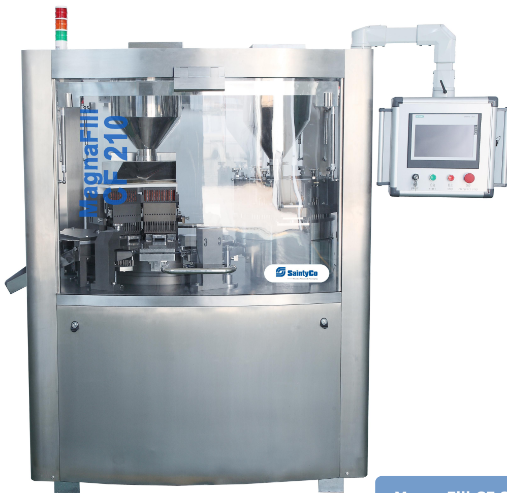
MagnaFill CF 210