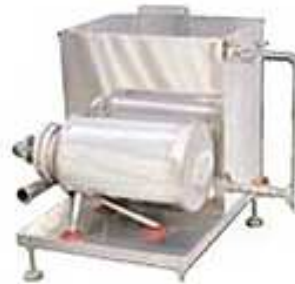
Distilled water supply tank and pump