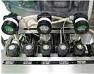
Input gauge & control valve