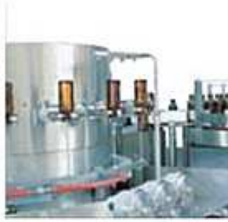
Send container and cleaning