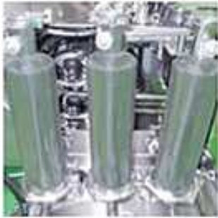
Air & cleaning water filter