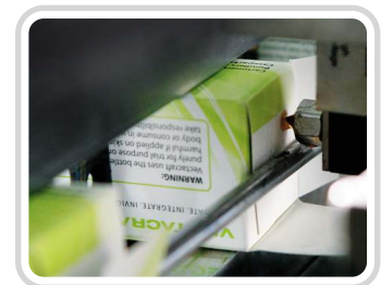
Carton Closure - Gluing