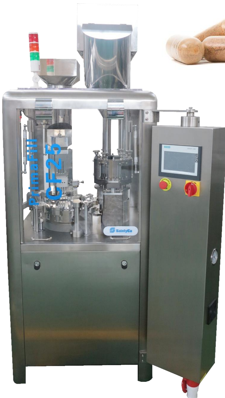
PrimaFill CF 25

The PrimaFill CF 25 Capsule Filling Machine is an intermittent motion, automatic hard gelatine capsule filler with an output of up to 25,000 capsules/hour, designed for filling hard gelatine capsules ranging in size from 0# to 4# with powder or pellets, size 00# & 5# are available as an option.