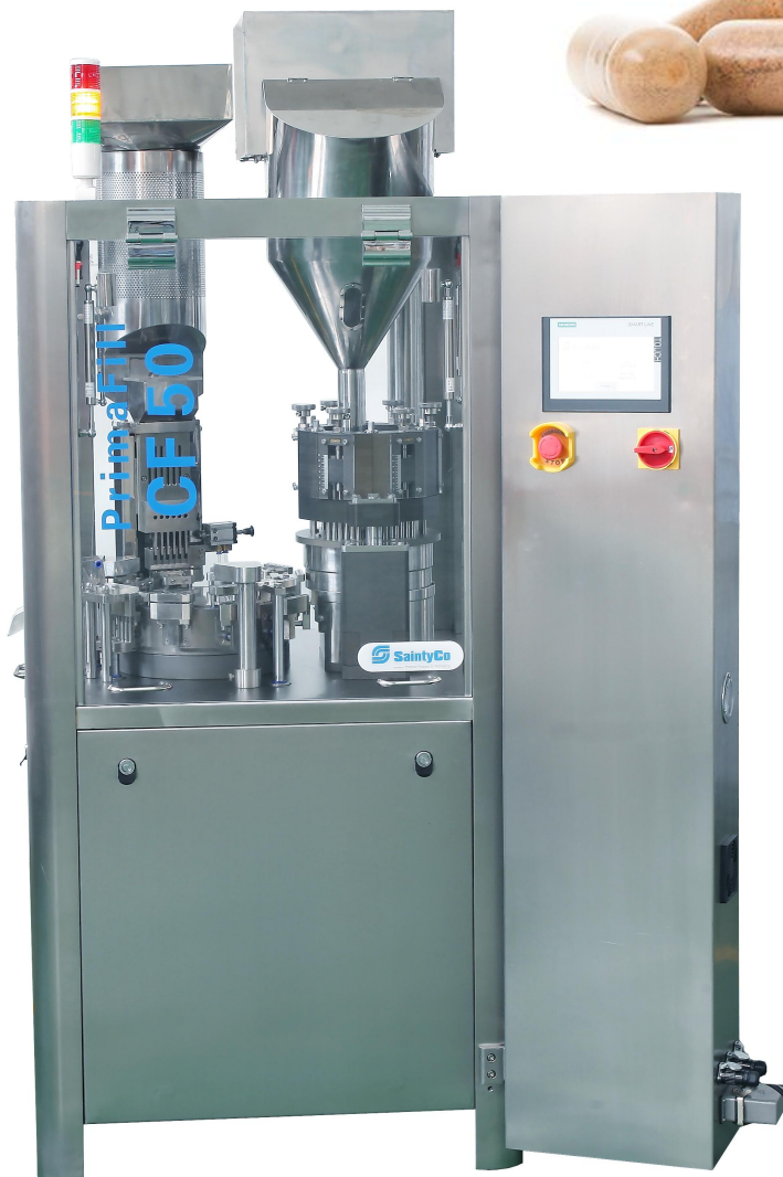
PrimaFill CF 50