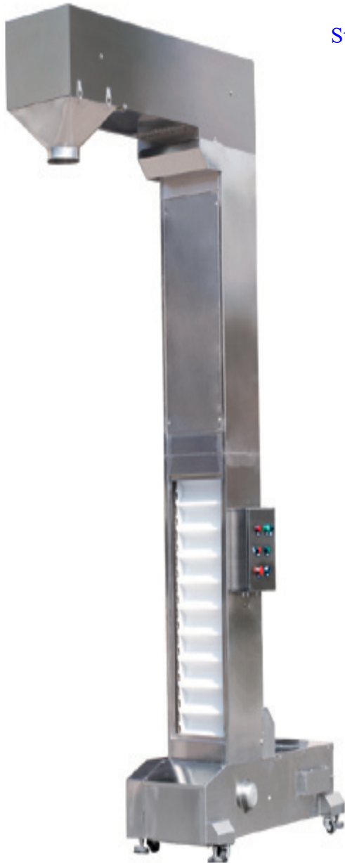
Stainless Steel Vertical Bucket Elevator, Model VB-18-6-2LSS