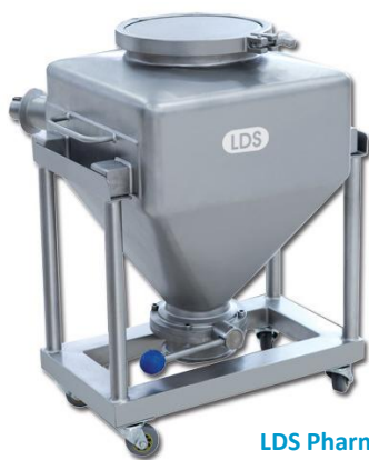
LDS Pharma Bin

HSD series Bench Top Blender is mainly used in laboratory solid preparation for mixing of granules and granules, granules and power, powder and powder. Meanwhile, it is widely used in pharmaceutical, chemical and foodstuff industries.