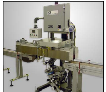
The Series 1800 can also be designed with a light duty or heavy duty (as shown) side hugger belts.