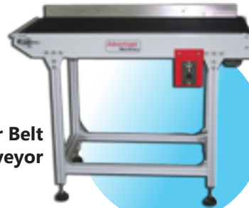
Power Belt Conveyor