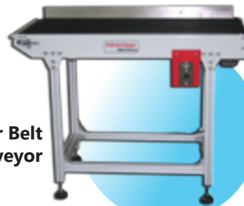
Power Belt Conveyor