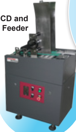
Automatic CD and Book Feeder