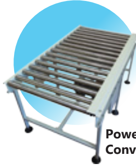
Power Roller Conveyor