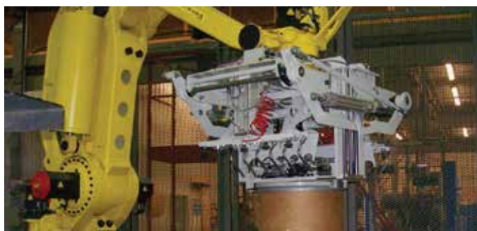
One end effector including ring gripping device for drums and finger gripper for bags