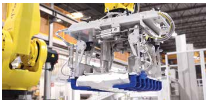
Finger gripper equipped with optional automatic bag width adjustment system