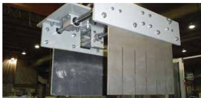
Bundle gripper with bundle height measuring system to compensate product density variations