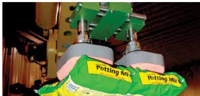
Vacuum gripper for bales, bags or boxes