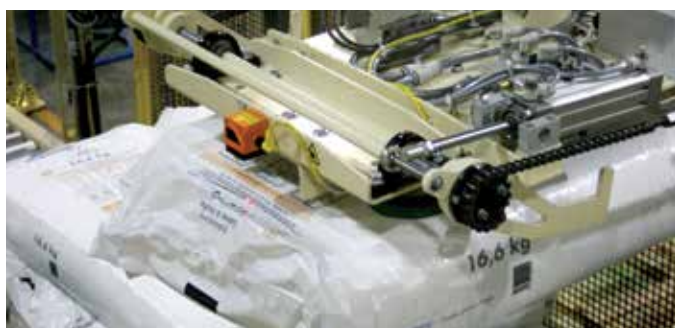
Vacuum gripper with pallet handling option