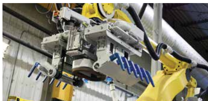
Dual function gripper: finger for palletizing and vacuum for depalletizing