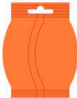
with euro hole