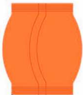
Standard pillow bag