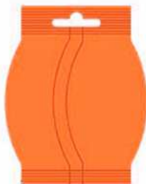
with euro hole