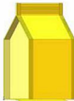
with 4 vertical seal