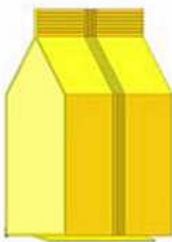
Block bottom bag