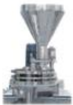
Volumetric Cup Filing Device (Granule)