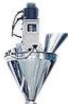
Auger Filler Device (Powder)