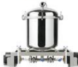
Gravity Dosing Device (Liquids)