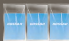
4. String sachets