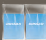
3. Twin sachets