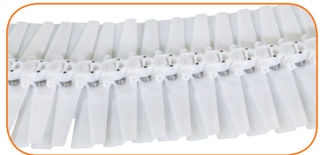
Patented Chain Design