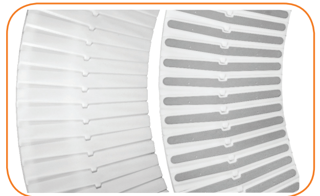
Flat Top Chain & TPE Friction Top Chain